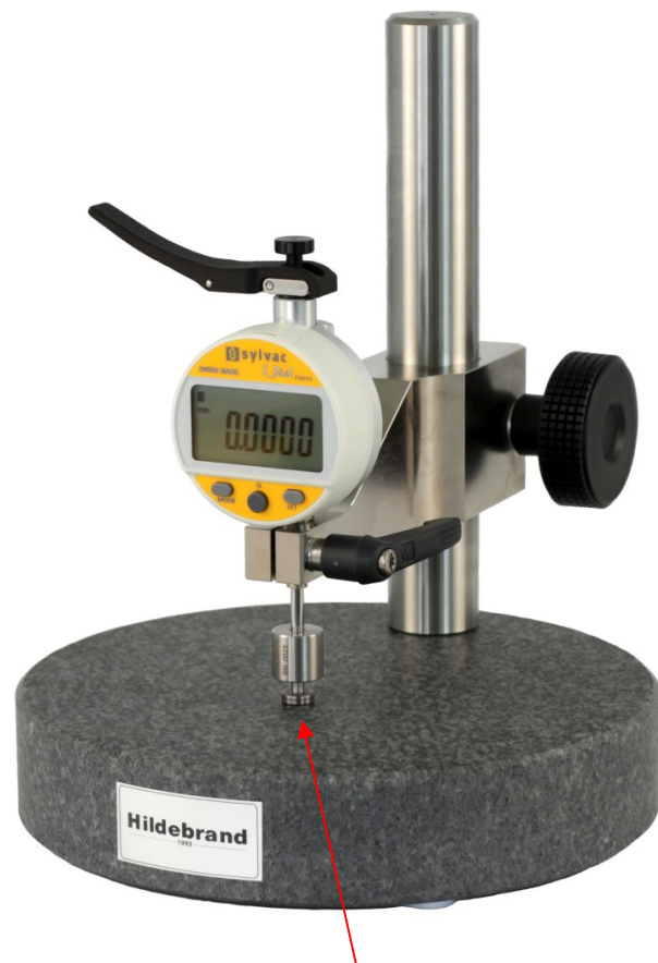
Interchangeable weight with foot